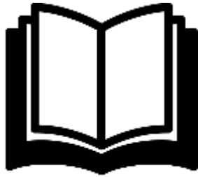
Books & eBooks