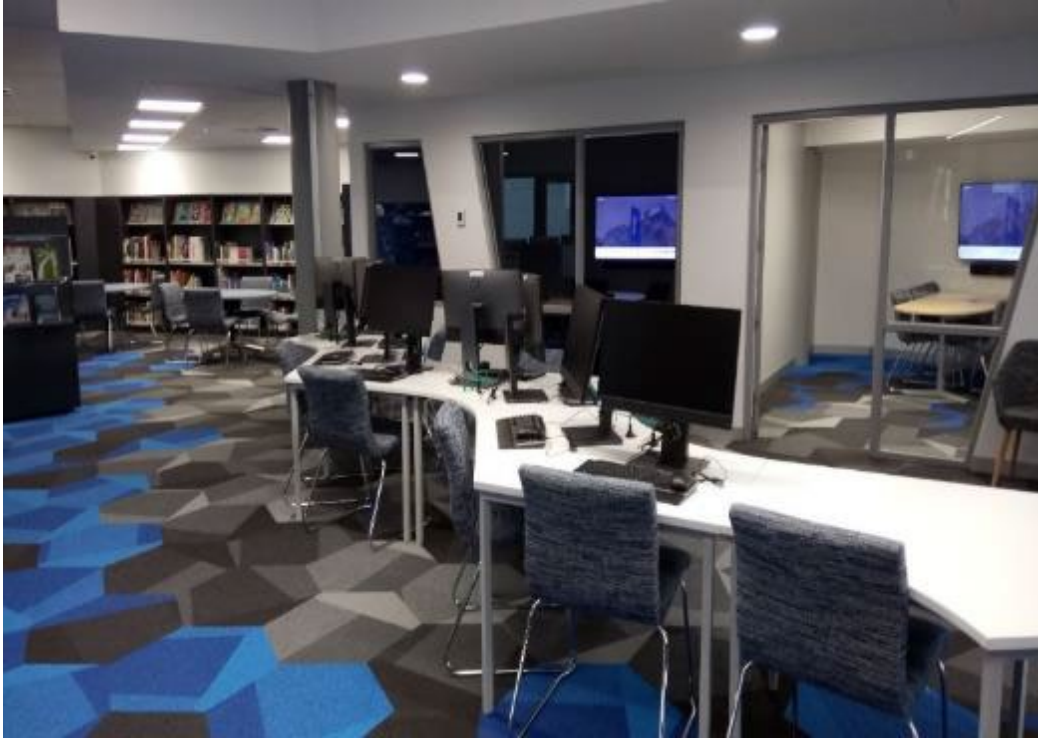
City Campus Library Building H