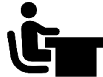
Spaces to Study