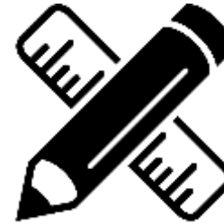
Research & Referencing