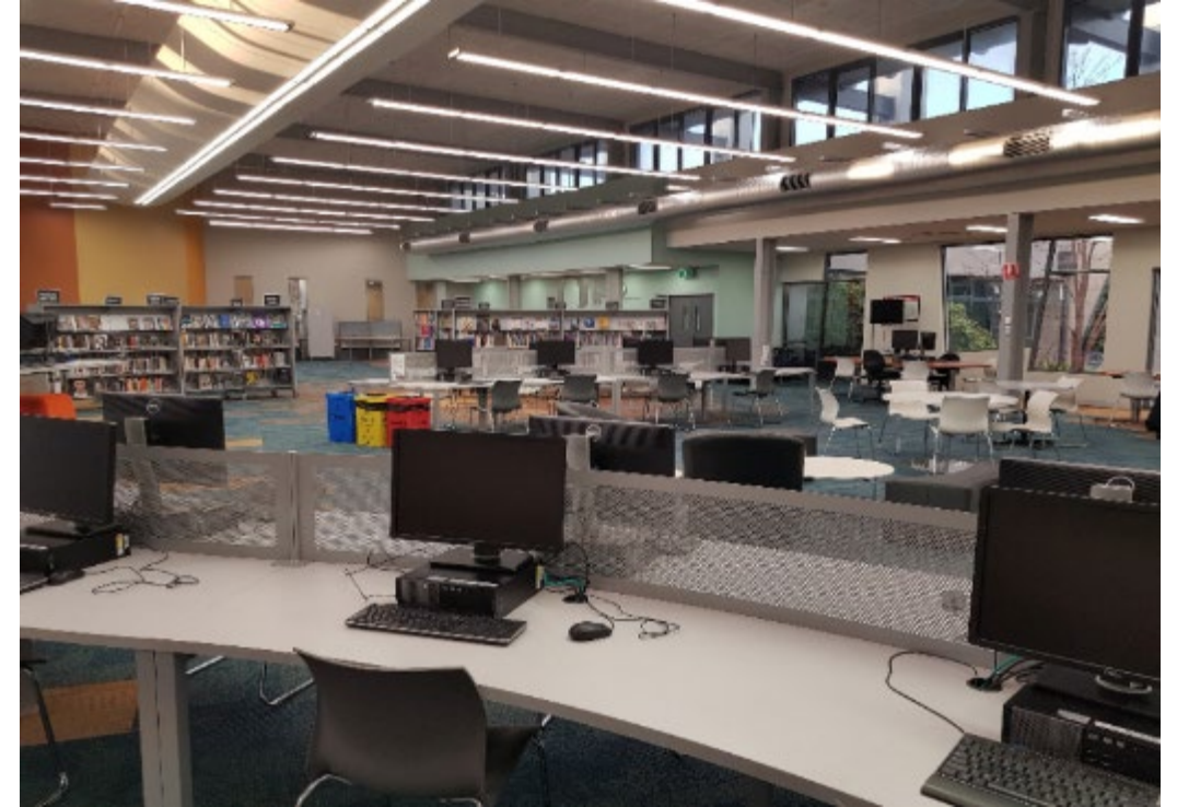
East Campus Library Building H