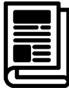
Articles & Reports