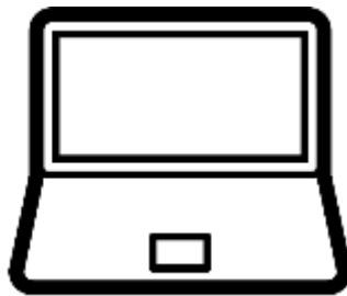
PCs, Laptops and Other Equipment Available